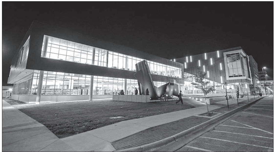
The Cedar Rapids Public Library is seen in 2015 in downtown Cedar Rapids. The library is one of 22 selected to participate in the Urban Library Council's new Building Equity: Amplify Summer Learning initiative.

This programming is "marrying the best of the ways in which the library can teach and support literacy, but then we can also tie that into those 21st-century skills, those STEM skills that are going to be so important for them to know and understand going