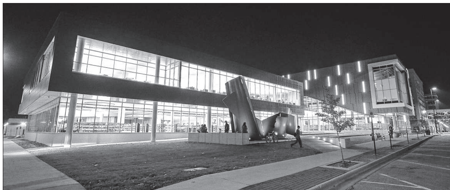
The Cedar Rapids Public Library is shown. Library cardholders here and in Iowa's other public libraries have access to HelpNow and VetNow by Brainfuse. The sites provide help with homework in core subjects and help in finding a job.