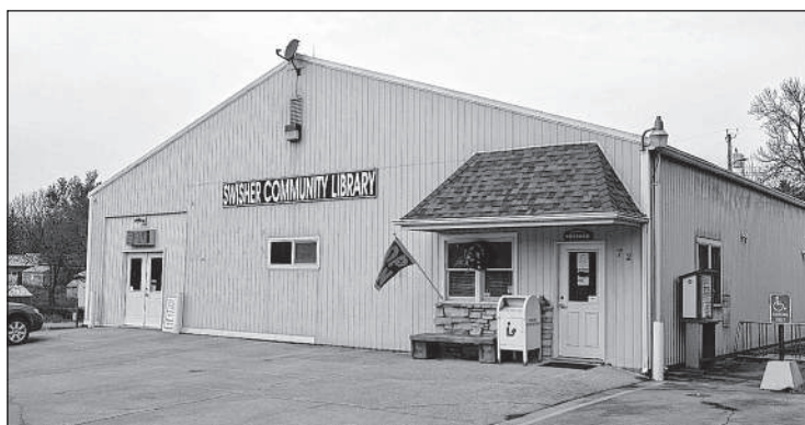
The Swisher Community Library.

connects qualified veterans and their spouses to Iowa businesses with job openings.