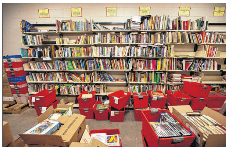
Donated books await evaluation and sorting Monday the Cedar Rapids Public Library.