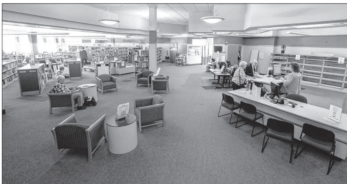
The Marion Public Library is shown in 2019.

VetNow also connects veterans with an expert to help them learn about what benefits they can access through Veterans Affairs. The site also